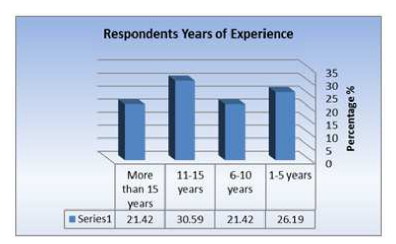
Figure 2: Respondents Years of Experience.

The study also considers the respondents' years of experience. The years of experience were classified into four main categories: "1-5 years", "6-10 years", "11-15 years" and "more than 15 years". The results showed that 21.42 % of the respondents (9 Architects/Engineers out of a total of 42) had been practicing for more than 15 years, 30.59 % (13 Architects/Engineers out of a total of 42) have experience ranging between 11-15 years, 21.42 % (9 Architects/Engineers out of a total of 42) have an experience ranging between 6-10 years, while 26.19 % (11 Architects/Engineers out of a total of 42) have at least 5 years or less as shown in Figure 2.